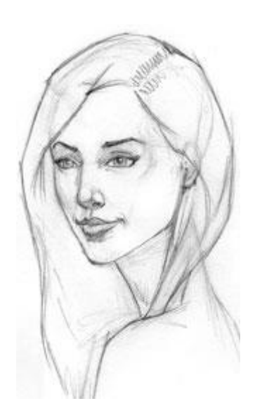
Step # 6 Continue your observations, refining and resolving areas as you go until you have reached the level of finish you desire.