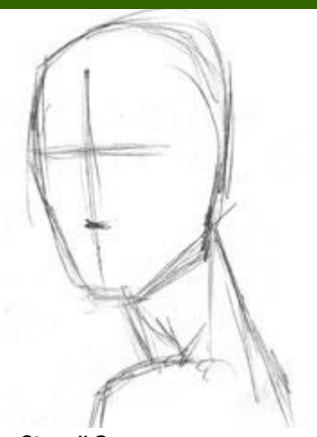
Step # 2 Next mark the primary proportion divisions. First, place a centre line and a brow ridge where you feel it should be. Then mark the base of the nose. This sets up your division of thirds.