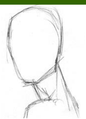
Step # 1 Start by sketching an oval shape that approximates the head keeping in mind general proportions.