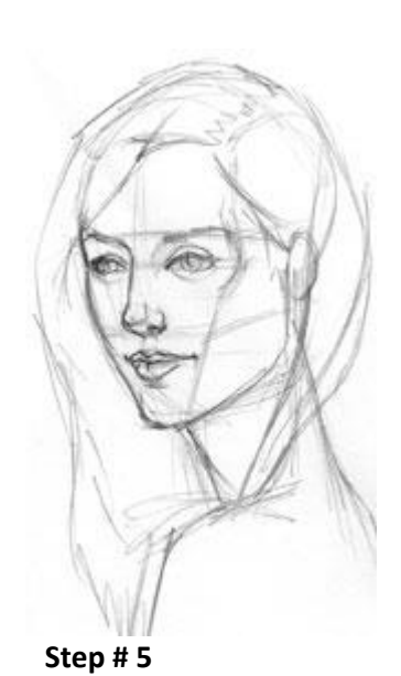
Begin observing the detail, subtle forms and shape of the features and head shape, block in the hair.